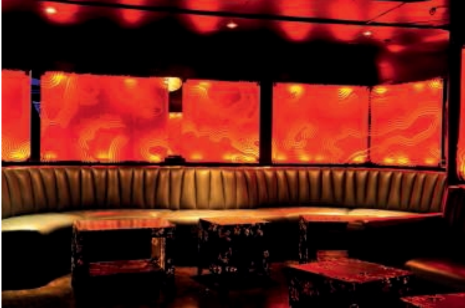
Window Film Company