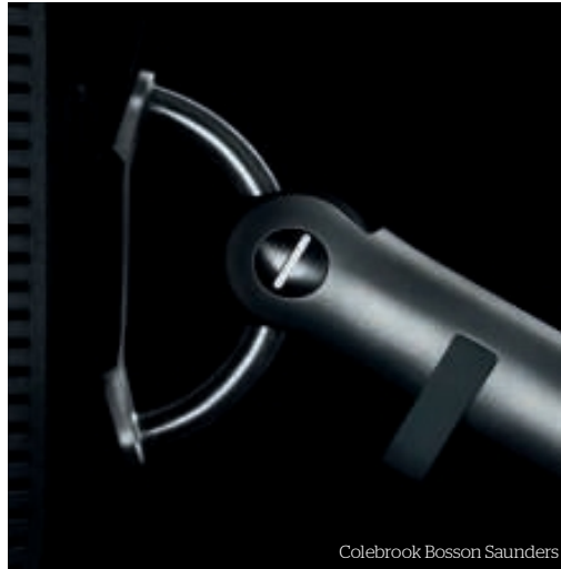
Colebrook Bosson Saunders